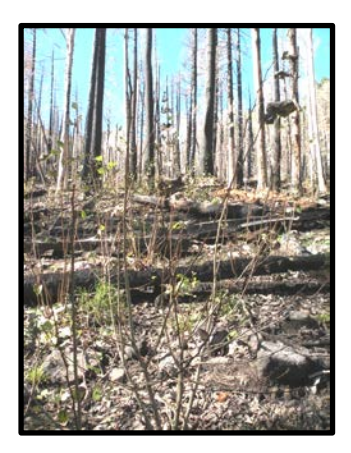
Browsed aspen suckers soon after wildfire in northern Arizona

Regardless of disturbance aspen or type, maintaining aspen resilience is highly dependent on local levels of ungulate herbivory (Seager et al. 2013). In the West, prominent aspen browsers include cattle, sheep, elk, and deer. If great care is not taken to protect postdisturbance and posttreatment stands from