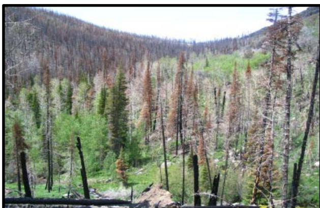
Fig. 1. Unburned aspen surrounded by severely burned conifers in the Jarbidge Mountains, Nevada

The relatively high fuel-moisture content in many aspen stands often makes them resistant to fire spread (Fig. 1). However, fire will carry through aspen stands when fire-weather and fuel conditions are ideal (e.g., when fire-prone conifers are present). Aspen are easily top-killed by crown fires. However, because aspen has thin bark, even low intensity fires can result in mixed- or high-severity effects, and surviving aspen trees are often stressed and highly susceptible to secondary mortality agents (Baker 2009).