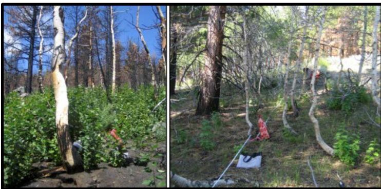
Fig. 4. Two years post-fire: high severity (left) and low severity (right). Note differences in the density and growth rate of aspen regeneration

Aspen restoration and management strategies are more likely to be successful if they incorporate the functional role of